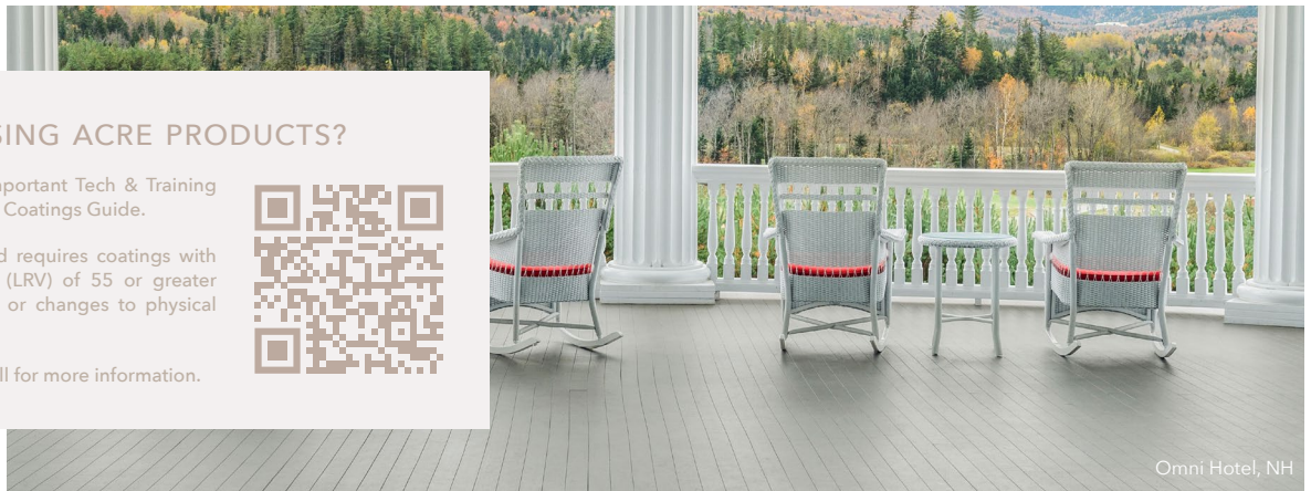
Omni Hotel, NH