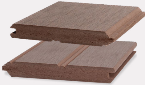
EDGE & CENTER BEAD SIDE

Add a sophisticated charm to your space with edge and center bead wainscoting or siding.